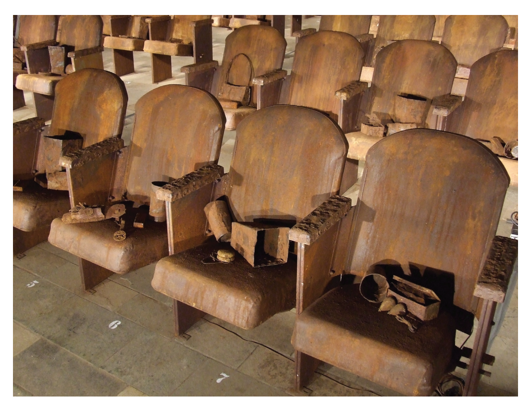
Fig 2. Die Einde/The End in the Reservoir of the Oliewenhuis Art Museum in Bloemfontein during the exhibition Time and Space in 2013 '

has a strong visceral sensory memory of a specific person. The knowledge of these literal connections is, however, not revealed to the spect-actor. Their relevance is to the evoked interpretation, both from the sincere and insightful handling by the artist, to the reflective reception induced in a spect-actor.