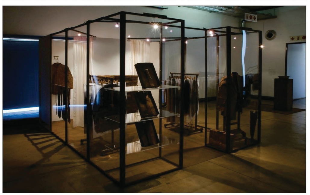
Fig 3. A montage of images from artworks exhibited as part of The Archaeology of Time exhibition in the Pretoria Art Museum, 2006 (Baggage Arrival 2001 and Guests 2002). The last work, Uitverkoping/Sale 2009 was exhibited during the Uprooted exhibition at the University of Johannesburg Art Gallery in 2009. Photos courtesy of the artist: Jan van der Merwe

The section that follows is reflexive and reflective, and includes ex-post facto data gathering, where a random sampling of the visitors who attended the exhibition were interviewed. It was a first first-hand experience of installation art for some of the visitors, and the often-unexpected adaptation of spaces was also new to all public present. The transition from mere viewing spectators into the role of witnessing and activating spect-actors was perceptible. Noticeable role acquisition was especially evident with reference to these installations at the exhibition: Confessional/Biegbak (2003), Eclipse (2002), and Die Einde/The End (2006).