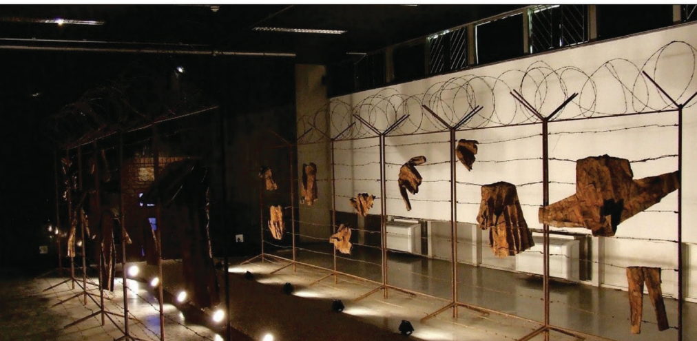
Fig 5. A montage of Eclipse (2002) in 2006 in the Albert Werth Hall in the Pretoria Art Museum during the retrospective exhibition entitled The Archaeology of Time

The individual spect-actors approached the confessional installation and ventured in, beyond the small curtain, and those that have stood and washed dishes at the kitchen sink, found themselves in a familiar position where they were met with a memory jogged by physical activation of moments spent in reconsideration and reflection. The enclosed room becomes, for a time, a small personal and poetic space. As a spectator, the visceral response generated from the physical embodied memory of time/s spent in such a position is further enhanced by the reality of the situation, where the 'actor' is (re)assuming a familiar role, and reflecting on the reflections of their memories. The realisation also is further impacted when the spect-actor is faced with the symbolism found in the title Confessional/Biegbak, and even if they have never literally experienced being in a catholic confessional booth (and if they have, this compounded the experience), they certainly can attest to the reflective emotional engagement they have with the intimate private space - a spiritual experience. When the spect-actors emerged, their demeanour and expression had changed. Many had a sense of calmness and expressed a wistful gaze. Some were quite emotional and spent almost as much time outside the booth in quiet contemplation as they had inside. The personal experiences and emotional memories were engaged through the embodied activation of the space.