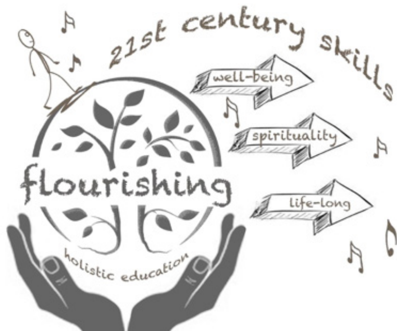
Figure 3: Flourishing with music: approaches to prepare undergraduate music students to find their own wellbeing in life.

Figure 3 represents the music students who can become inspired 21st-century citizens who enjoy their work, share their talents and skills with others, and make a difference in their own lives as well as in their communities that so desperately need wellbeing and spiritual growth. They will be able to change their environments with their creations and performances, and people will appreciate their eudaimonia .