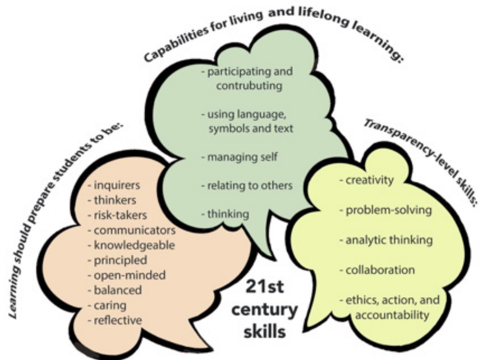
Figure 1: A conceptual diagram of skills for the 21 st -century learner

Skills for career development and individual achievement are mostly investigated with the global digital citizen in mind. However, these skills are also relevant in the music workplace. The development of transparency-level skills (e.g. problem solving, creativity, analytical thinking, collaboration and accountability) should be integrated purposefully into fundamental content areas of music programmes to motivate learning. Transparency-level skills cultivate problem solvers who can work self-sufficiently in a music environment where they can demonstrate their distinctive creativity. Inquisitive learners will challenge themselves to solve problems as they arise to generate effective results. Analytical thinking represents the cognitive domain and focuses on higher forms of thinking such as evaluating musical concepts and processes using a creative approach. The sharing of ideas, skills and strengths through teamwork in the musical workplace is encouraged to achieve a common goal. Collaboration depends on communication and individuals must understand that accountable communication represents their values, ideals and beliefs.