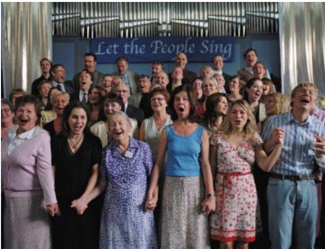
Image 1 As it is in Heaven ( www.spiritualityandpractice.com/films/reviews/view/19648 )

A famous conductor returns to his small village and is asked to breathe new life into the village choir. Like him, all members of this choir have been exposed and damaged through abuse, humiliation, negative attitudes and lack of trust, and are consequently in search of acceptance through their own voices. He teaches them to find their own voice tone; one can perceive them discovering themselves through singing, which in turn enhances their trust in one another and socially as they become aware of, and respect, situations in their small enclosed village. The film is about people whom one can relate to in real life and the experience enriches the individual characters and their personal conflicts within themselves and their prejudice towards others. When a choir is formed, the viewer perceives more conflict that stems from a lack of spiritual and social connection within the group. Only when dramatic situations occur, do they all realise that their own problems actually unite